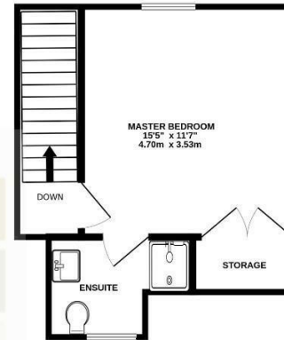
2ND FLOOR 241 sq.ft. (22.4 sq.m.) approx.