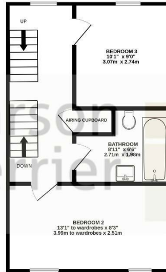
1ST FLOOR 380 sq.ft. (35.3 sq.m.) approx.